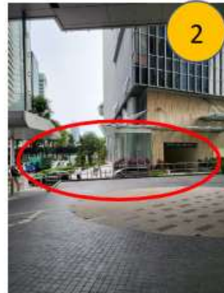
Designated loading vehicle area.

Loading vehicles are to stop at designated location next to carpark entrance. Off-load items and push to the loading entrance to change pass at Security office and take the service lift to level 7 or 8. The driver is always to man the loading vehicle as the security may require the loading vehicles to move their vehicles for other loading vehicles should space be a constrain at the designated loading area for vehicles.