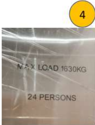
Service lift max load - 1630kg

Location to change pass at security counter (ground floor). Opposite from designated loading vehicle stop area. The service lift is beside the security counter for pass exchange. Avoid peak office hours to avoid longer wait times.